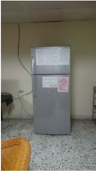
1 refrigerator for the three buildings.