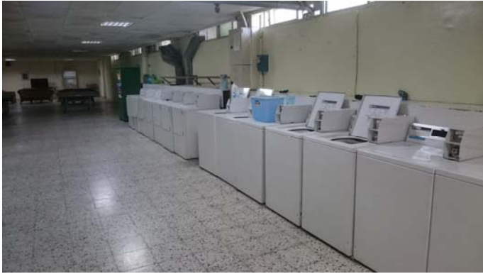
Washer and dryer machines