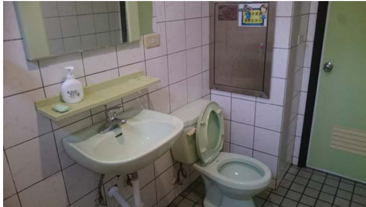
Two rooms share a bathroom.